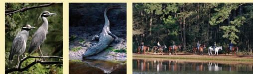
Sea Pines Museum and Forest Preserve Foundation 2011 Calendar

2011 Forest Preserve calendars are now available for $10 at the CSA Building 175 Greenwood Drive.